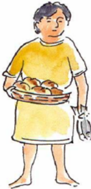
Loaves and Fishes