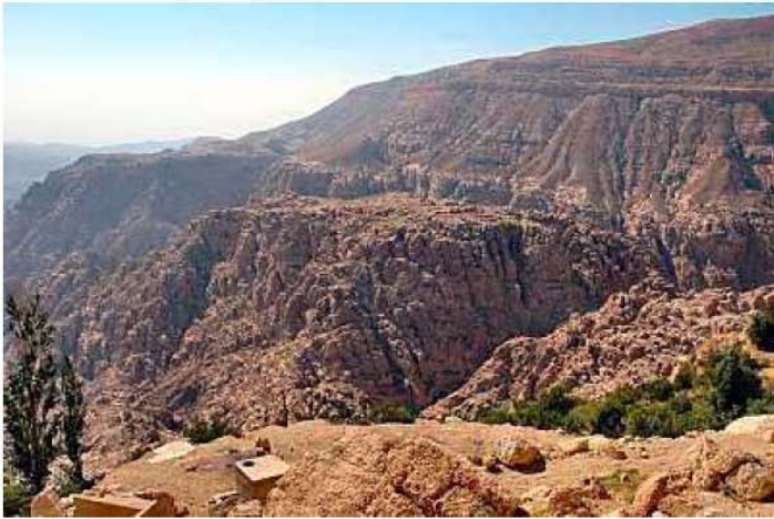
Sela - once capital of Edom

when Edom was in Moabite hands Amaziah re-conquered it and slew 10,000 in the Valley of Salt, and then sent another 10,000 to their death by casting them off Sela, a massive rocky plateau 1,000 feet above Petra.