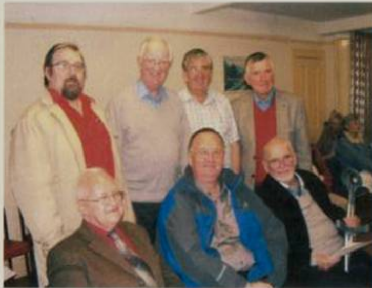
"THE MAGNIFICENT SEVEN" MALE MEMBERS OF THE GUILD

All our meetings are open to visitors, but a special invitation is extended to all members of the Congregation and friends to join us on 30th November for our St Andrew's Day Concert.